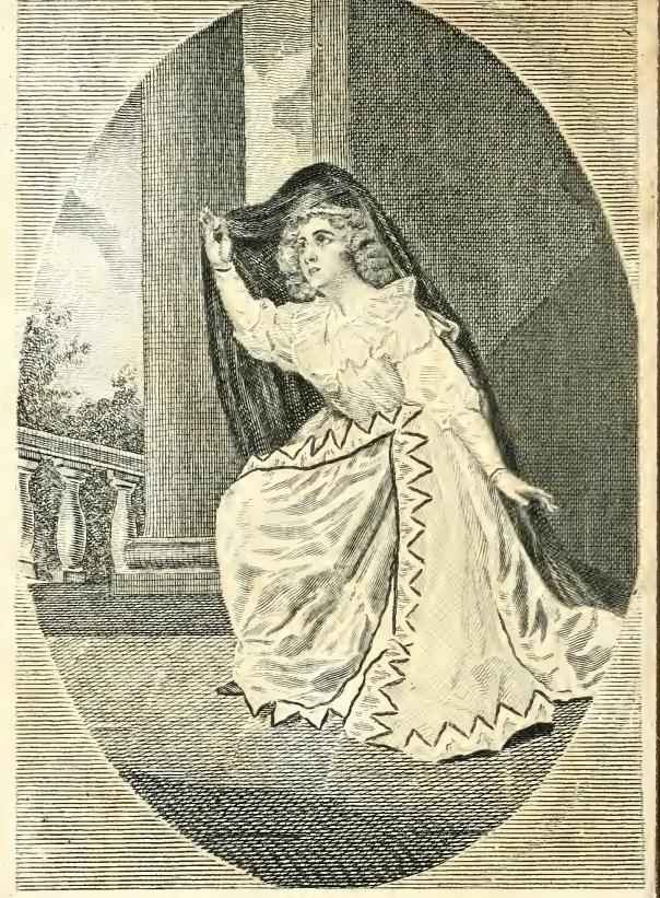
De Wilde ad vir pine.